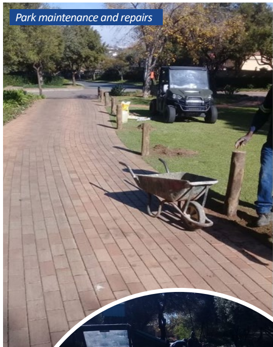
Park maintenance and repairs

Our dedicated maintenance team continue to attend to repairs and maintenance around our estate.