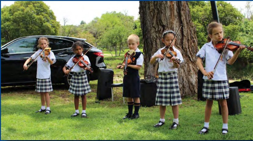
The Dainfern College Junior Prep Violin Ensemble and the Grade 7, Grade 8 and Grade 9 Marimba ensembles performing at the luxury car expo